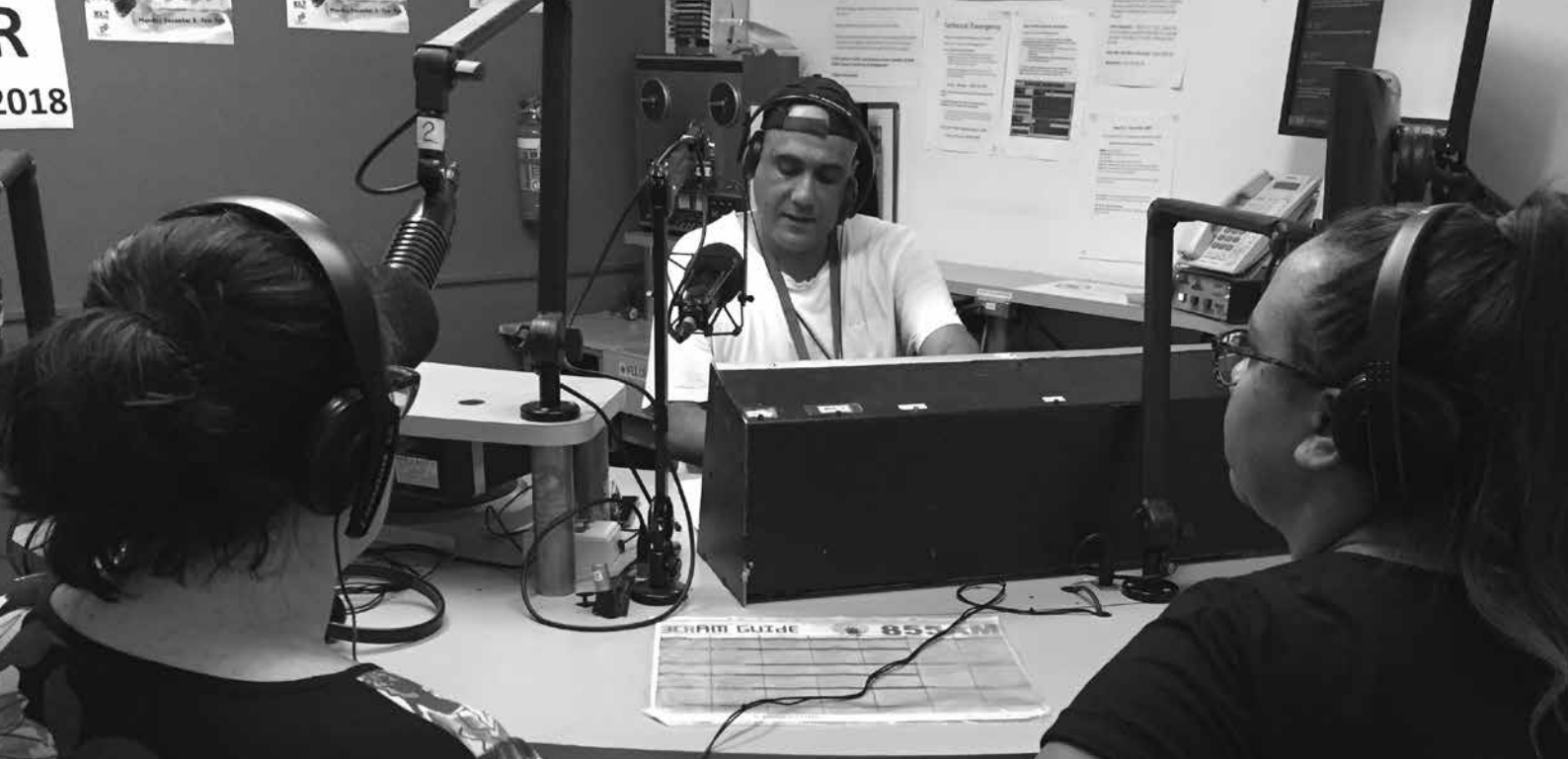
Billabong Beats with a live Disability Day show on 3 December 2018.